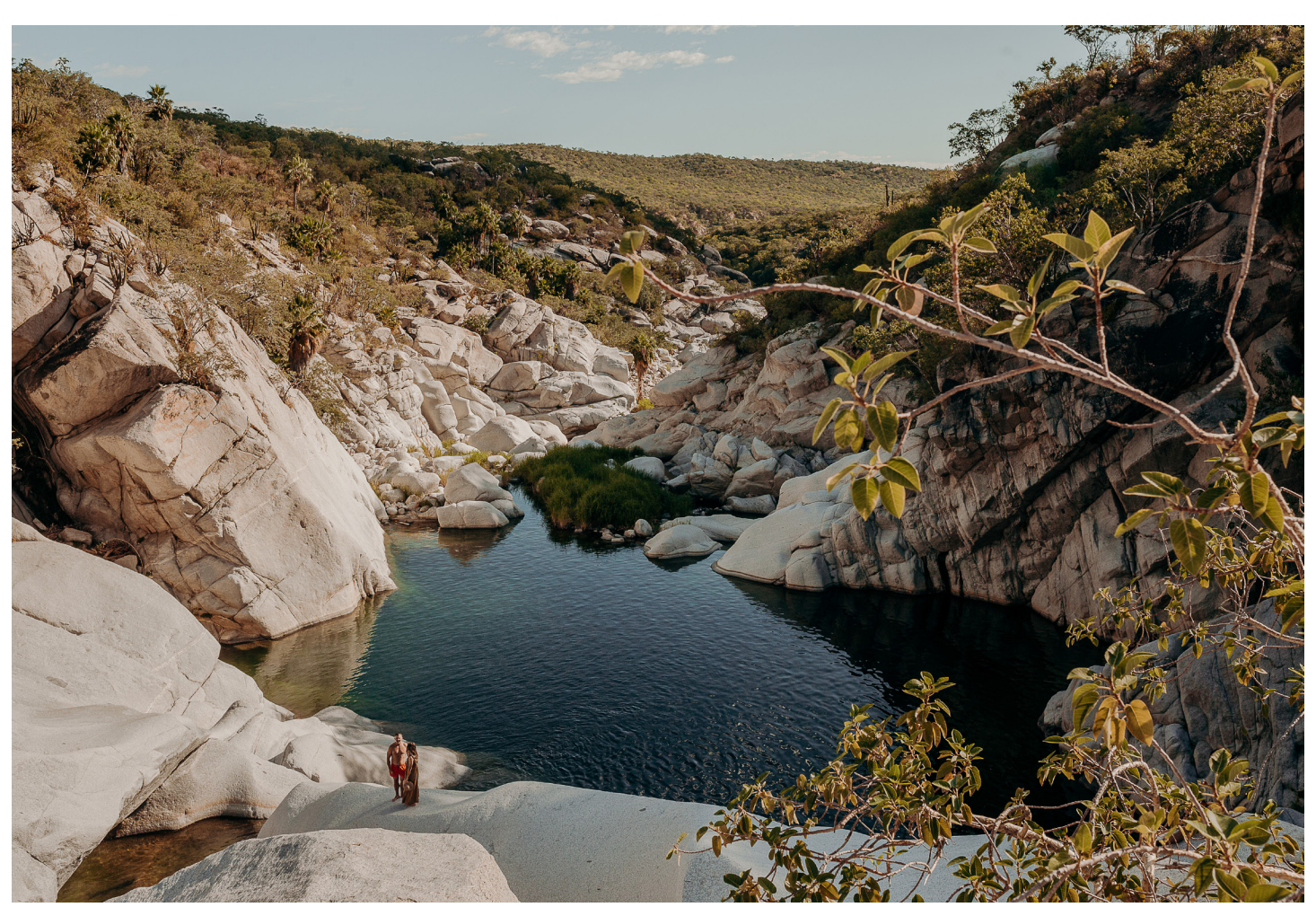
San Dionisio, B.C.S